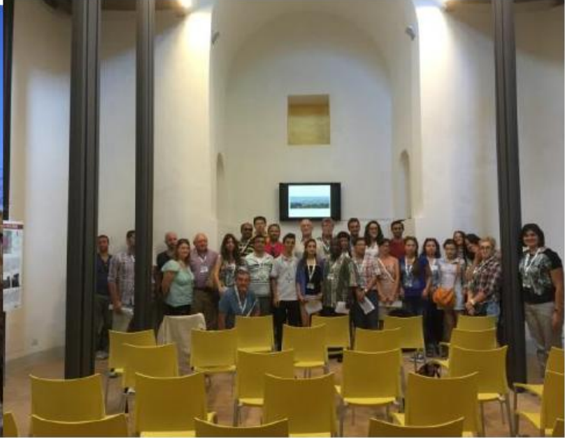
Sede Operativa Operational Headquarters